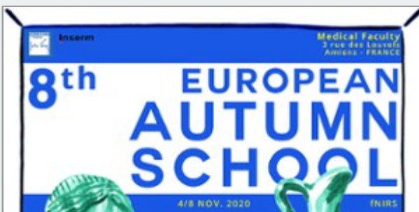
8th European Autumn School